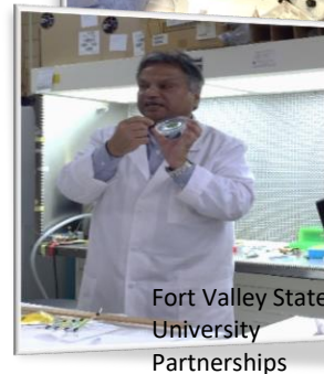
Fort Valley State University Partnerships